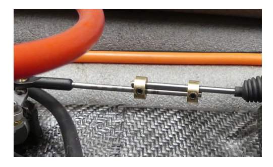
Photograph shows a typical adjustable control rod set up.

Servo control linkages need to be very robust – it is surprising how much force is needed to move a rudder especially under racing conditions. Although clevis fixtures are convenient they have a habit of springing away from the control arms when least expected. Ball-ended fittings are probably best, with nylon units being especially robust and reliable when high levels of vibration are present. The only drawback with ball-ended fittings is there is very little length adjustment. In some set ups the length of the control arm needs to be quite precise, for example when setting up throttle linkages with multiple ball joints. Splitting the control arm into two and using a collar, or collars, to introduce some adjustment, works well. It is worth making bespoke collars with a bore very slightly greater than the combined diameters of the control arms and arranging that the clamping screw bears down on the join between the two control rods.