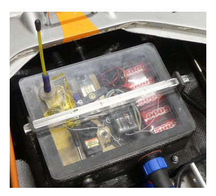
Photo illustrates a single bar closure, the advantage is that access to the inside of the radio box is quick and easy, but this set up needs to be tested carefully to ensure that there are no leaks. Moreover, the lid needs to be very thick to ensure reliable closure.

The simplest type of seal is an o-ring made from Viton<sup>®</sup>, silicone, or some other flexible yet waterproof materials, clamped down between the flat face of the top of the radio box and the lid. This approach works very well provided that the lid does not distort when tightened. In most cases, poly-carbonate sheet is used as the material for the lid because it is transparent and extremely strong. If a simple o-ring is used it should be fitted close to the clamping screws and it is best to super-glue it to the face of the radio box to keep it in place.