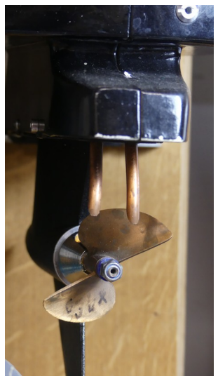
Photo shows water pick ups in a scale outboard motor setting. Two pick up are used – one for the motor and one for the ESC in the hull. © GNP

Photo shows a water pick up near the propeller of a model tunnel hull racer where the alternative location under the hull might be difficult as the hull is hardly in the water during a race. © GNP