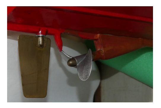
Photo shows a typical submerged drive scale water pick up. There is relatively little cavitation associated with the water flow near the propeller so this is a relatively safe technique.

up pipe and this can lead to steam being generated in the cooling jacket of the engine. Local hot spots can be a source of premature failures.