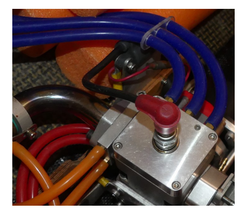
Photo shows a 2-in (red pipes) and 3-out arrangement (Quickdraw) unusually a water-cooled manifold (orange pipes) is also fitted.