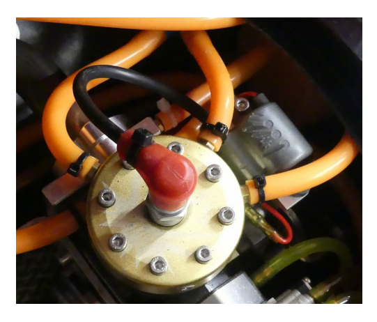
Photo shows a 2-in and 3-out arrangement (Tiger King 27 pro). The water outlets exit around the top of the cylinder head and the two inlets are partially hidden behind the water-cooled exhaust header. © GNP

Photo shows a 2-in (red pipes) and 3-out arrangement (Quickdraw) unusually a water-cooled manifold (orange pipes) is also fitted. © GNP