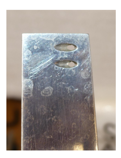
Photo shows an MHz rudder where the water can enter the rudder from both sides.

A rudder is probably the most often used way of picking up cooling water. The advantage of this set up is that the rudder blade is normally the lowest part of the boat and therefore is least likely to starve the engine of water. A water inlet on one side of the rudder is best; a water inlet that allows water to enter the water pick up from both sides of the rudder risks water flowing almost straight through the pick up at large rudder deflections. The only drawback of the rudder pick up is that they can pick up weed and block the water feed to the engine.