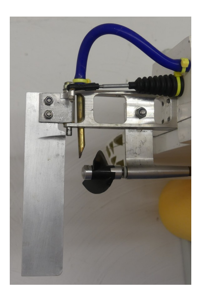
Photo shows a water pick up near the propeller of a model tunnel hull racer where the alternative location under the hull might be difficult as the hull is hardly in the water during a race. © GNP

Photo shows a typical submerged drive scale water pick up. There is relatively little cavitation associated with the water flow near the propeller so this is a relatively safe technique. © GNP