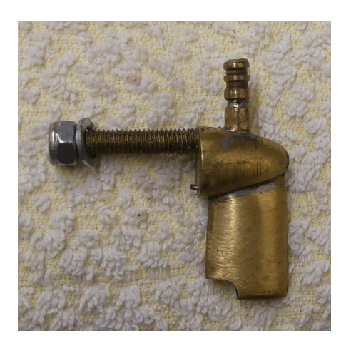
Photo shows a water pick up designed to be bolted through the transom – water is collected via a hole in the base of the downward pointing shaped strut and a water connection is made from the nipple through the transom.

A pick up mounted on the transom is favoured by some off-shore racers. One advantage is that the pick up is deeper in the water than the hull mounted types. The pick up shown in the propeller mounted section below can also be used on the transom to pick up water.